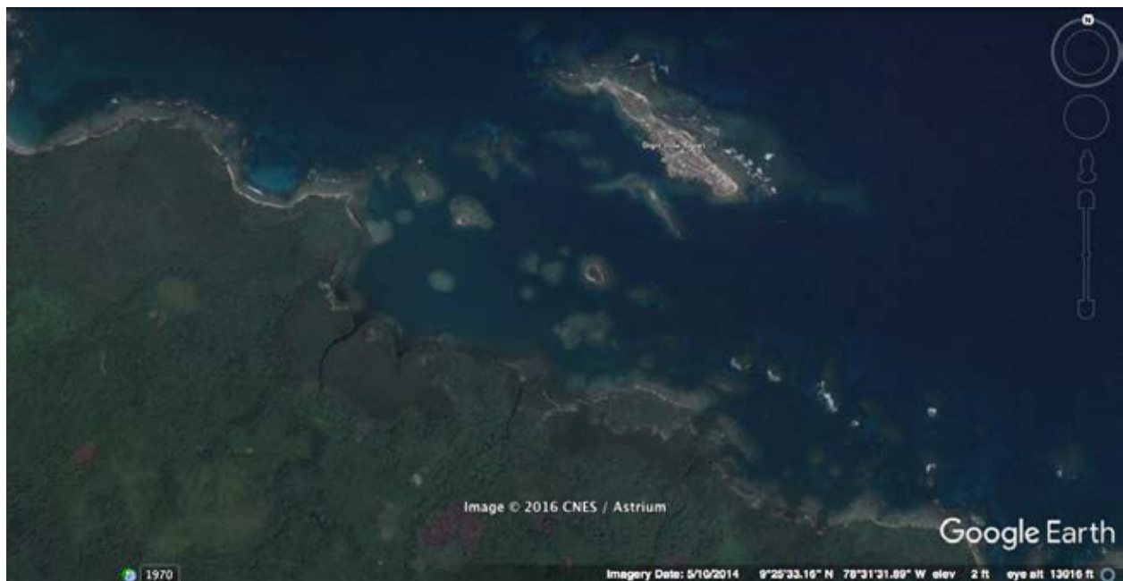
Google Earth's image of Digir (Isla Tigre).