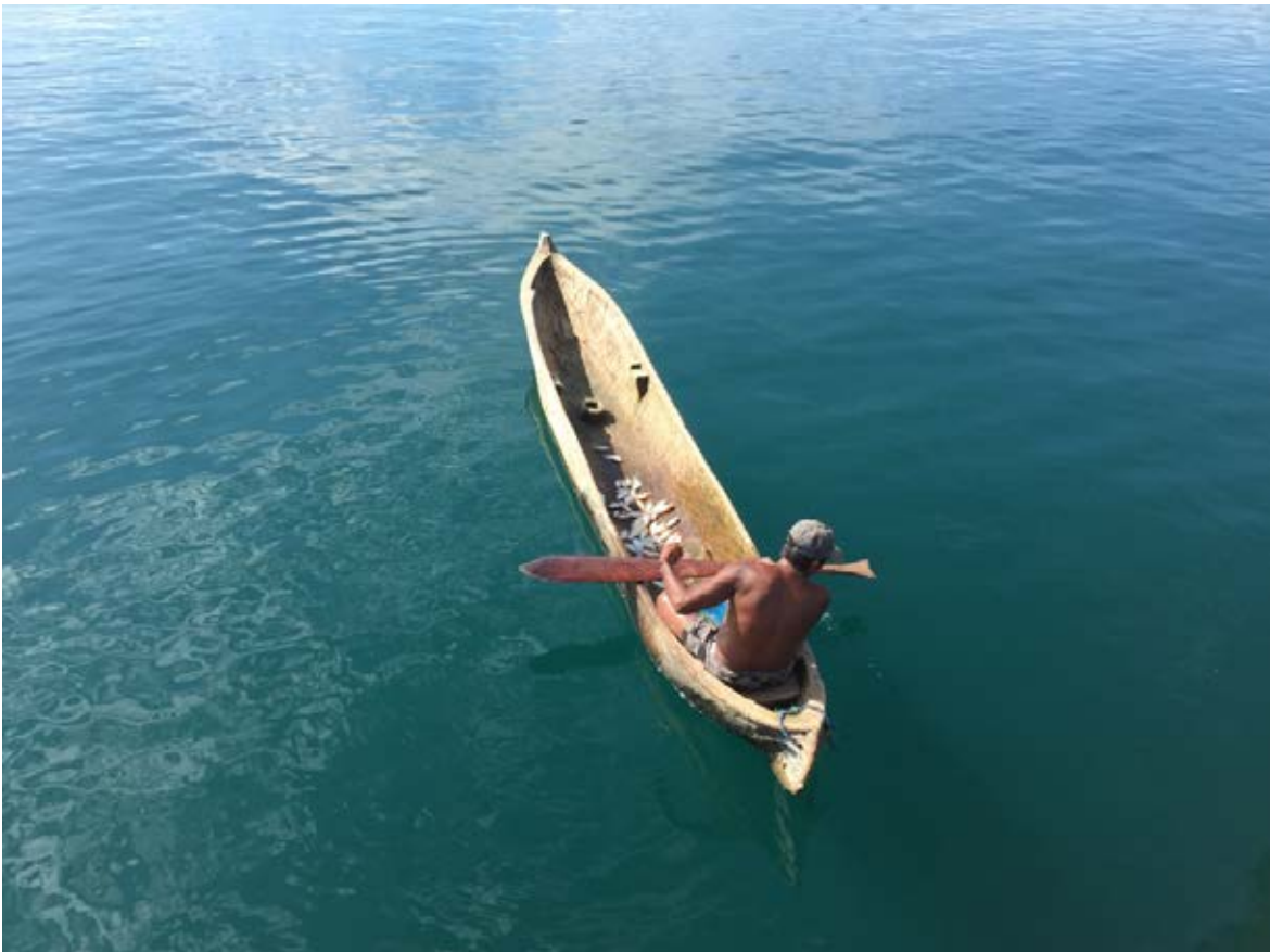
Guna fisherman in his “cayuco” at Playón Chico, Gunayala.