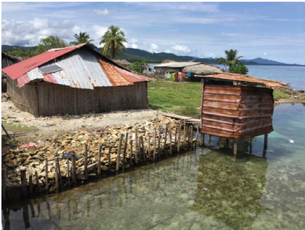
Landfilling in Niadub (Isla Diablo). This is the typical way landfilling is done in Gunayala to expand the area of the islands. The structure on the right is the typical latrine used on Gunayala's islands.

According to saila Morris, it is important to raise awareness in the community about the relocation because people cannot control nature. There are stories that tsunamis will come, but nothing has happened so far and they keep hoping that nothing will happen. Finally, saila Morris mentioned that during the 1980s three families decided to move to live in the mainland as a result of rumors about a natural disaster. However, when it didn't happen, those families decided to move back to the island.