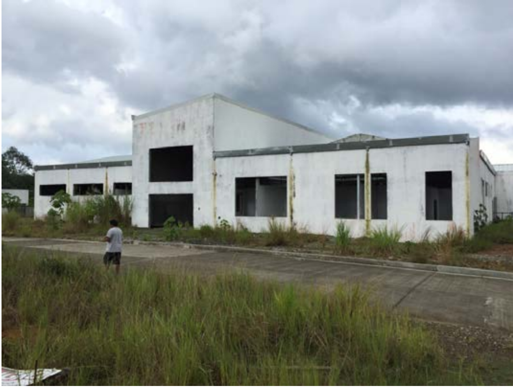
The construction of the health center in Gardi Sugdub has been paralyzed for the last two years. This picture taken on September 23, 2016 shows that the building has been completely abandoned.

Last year Panama's General Comptroller, said: