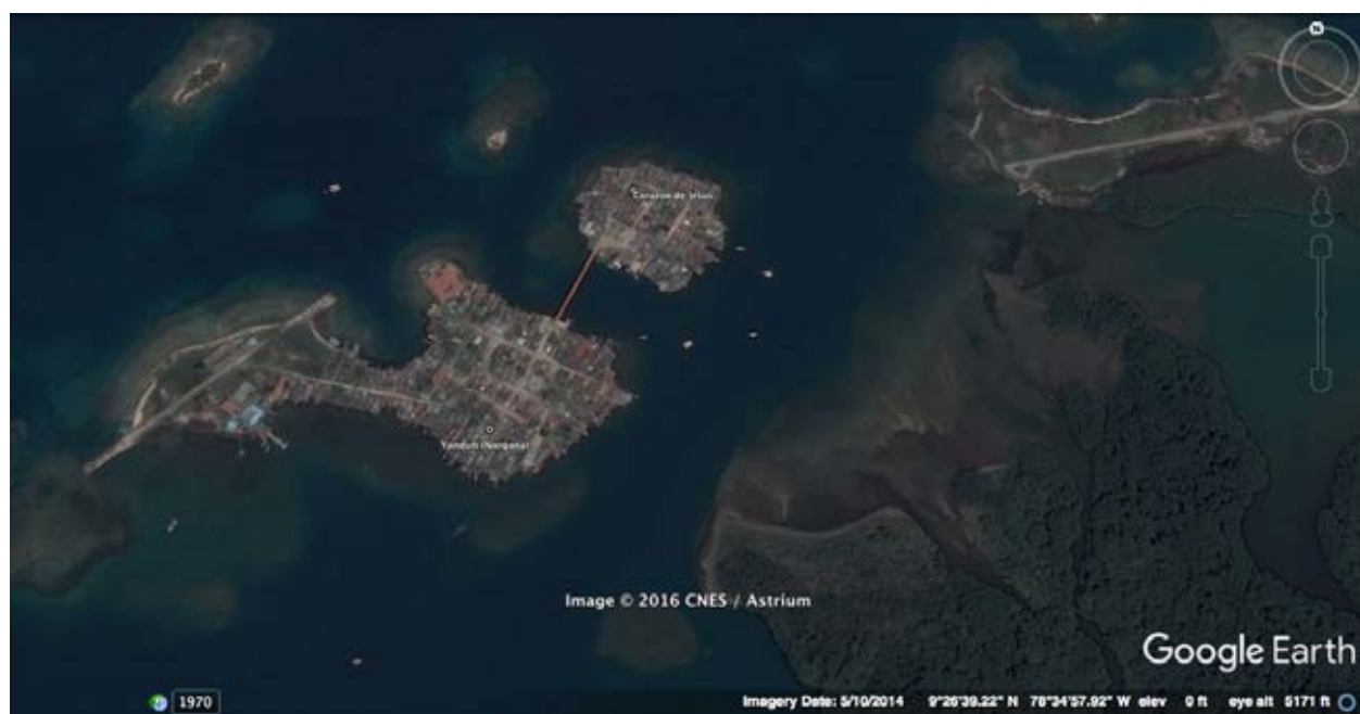
Google Earth's image of Yandub (Narganá) and Corazón de Jesús.