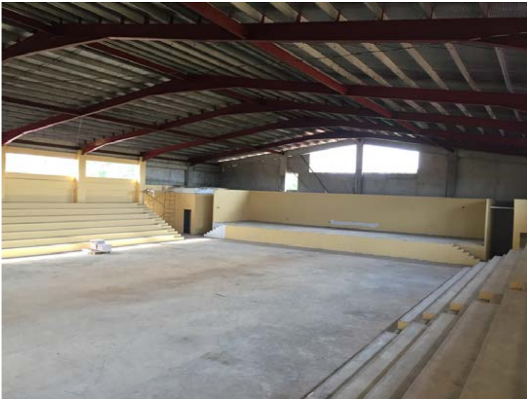
Gym at the new school complex in Gardi Sugdub as of September 23, 2016.

generously agreed to share their water with Gardi Sugdub, but the cost of constructing a new aqueduct may be prohibitive for the community as the cost of the required pipes for the 8 kilometer line would be around US$40,000 21 .