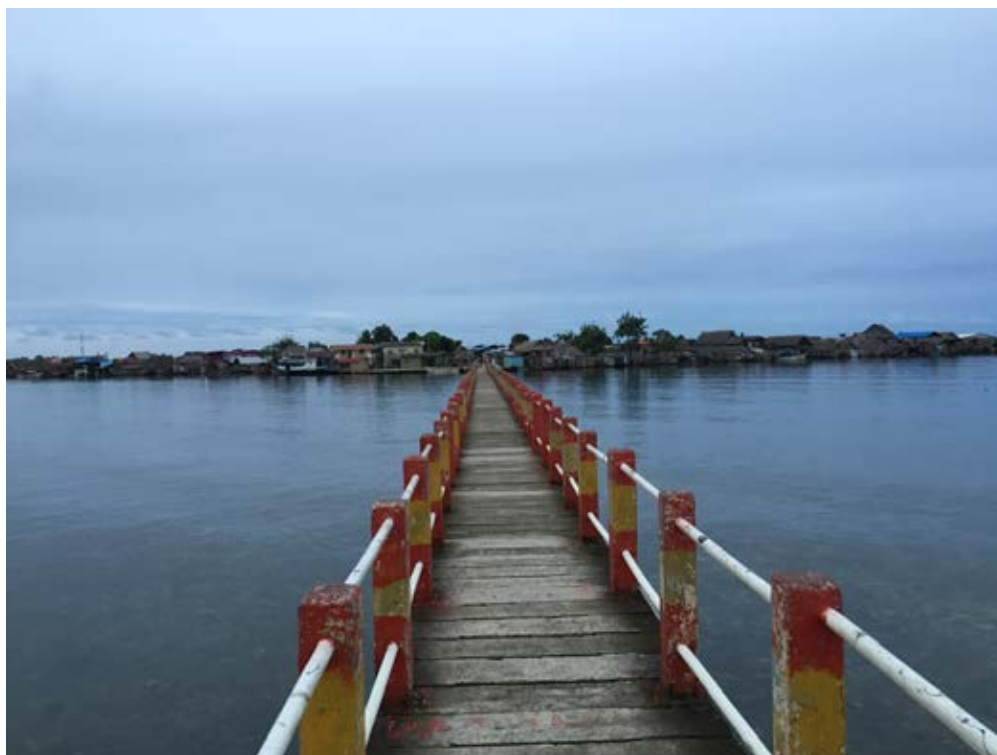
A 165m pedestrian bridge that connects the community of Playón Chico to the mainland. The picture was taken coming from the mainland to the island.