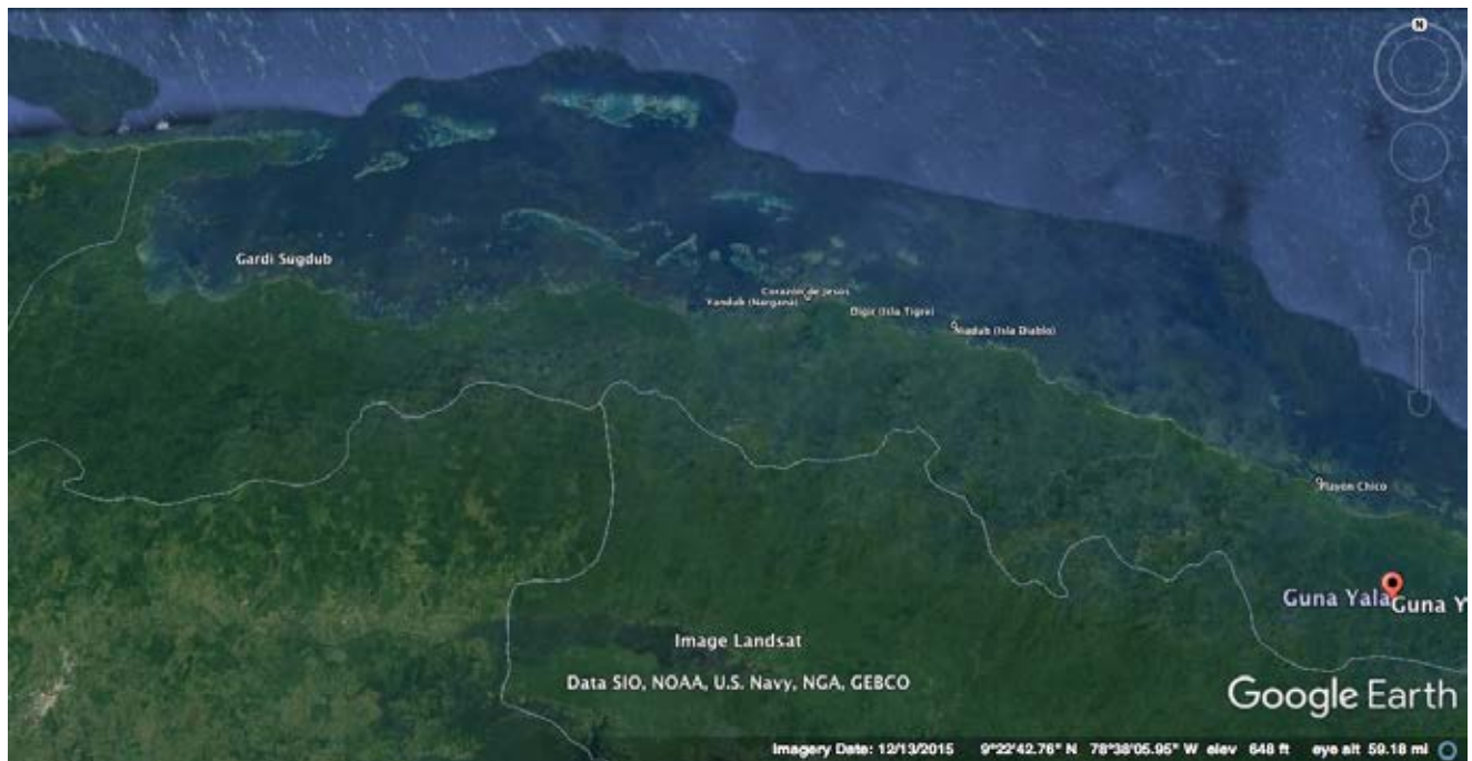
Google Earth's image from Gardi Sugdub (left) to Playón Chico (right).

There are ten sections of this report. Following the executive summary and introduction, section three provides background information on the relationship between the Panamanian government and indigenous peoples. Section four provides a detailed update on the relocation of Gardi Sugdub. Section five details the first steps taken by the community of Playón Chico, which has the second most developed relocation process in Gunayala to date. Section six provides general information about the relocation status among some of the other communities we visited. Section seven sets out the opportunities, challenges and pitfalls posed by the relocation of Guna communities. Section eight highlights the urgent need for government action to support relocation in Gunayala and to apply the Peninsula Principles on Climate Displacement within States. Section nine summarizes Displacement Solutions' conclusions, and section ten makes recommendations both for stakeholders who are already involved, as well as others who need to become involved, in order for the relocation of Guna communities to be successful.