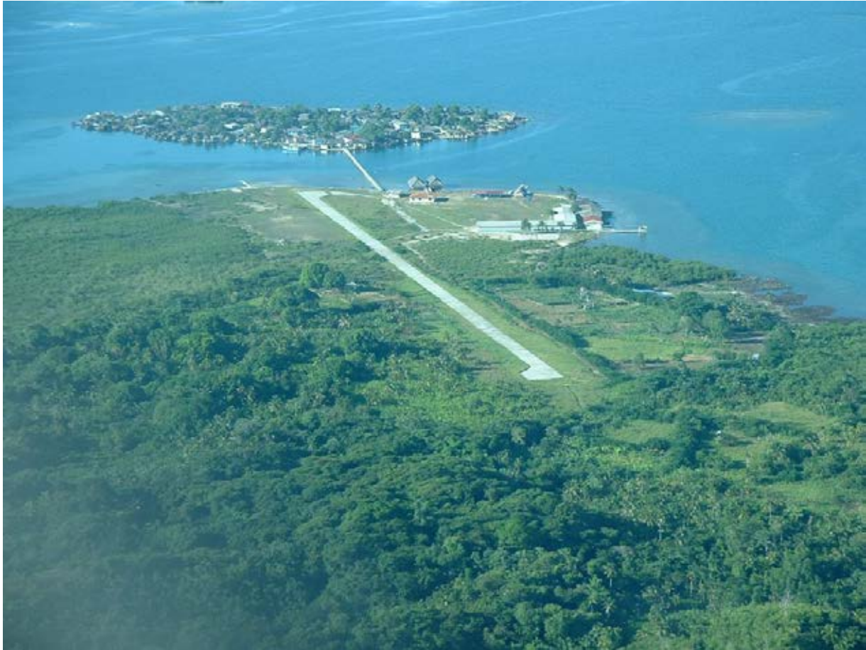
Aerial view of the island community of Playón Chico around year 2008. The school is located to the right of the runway on the mainland. The community owns land toward the end of the runway on the lower right side of the picture, but near the coast.