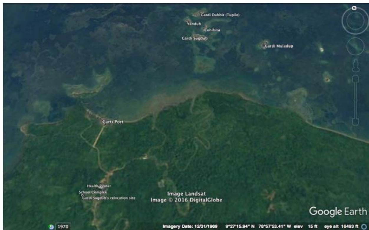
Google Earth's view of Gardi Sugdub, and surrounding communities, the port of Carti and the relocation site.