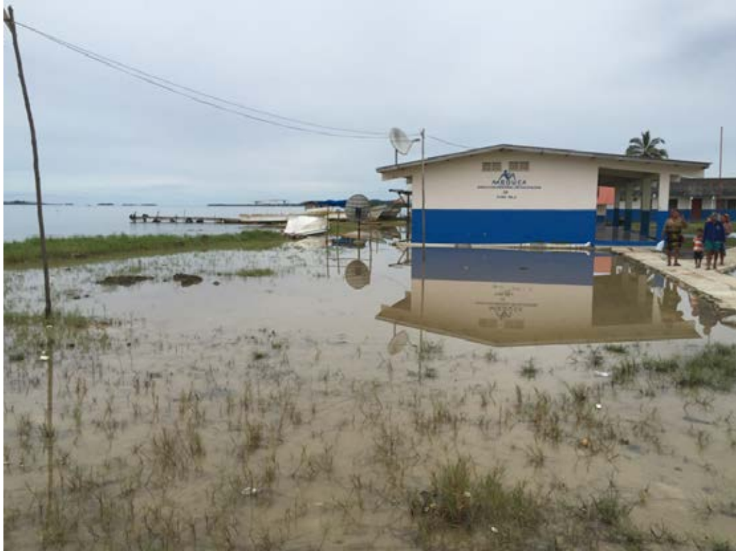
The regional administrative offices of the Ministry of Education (Meduca) in Playón Chico after a rainy day. The ocean is on the left and remaining buildings of Playón Chico's school are located to the right of Meduca building.