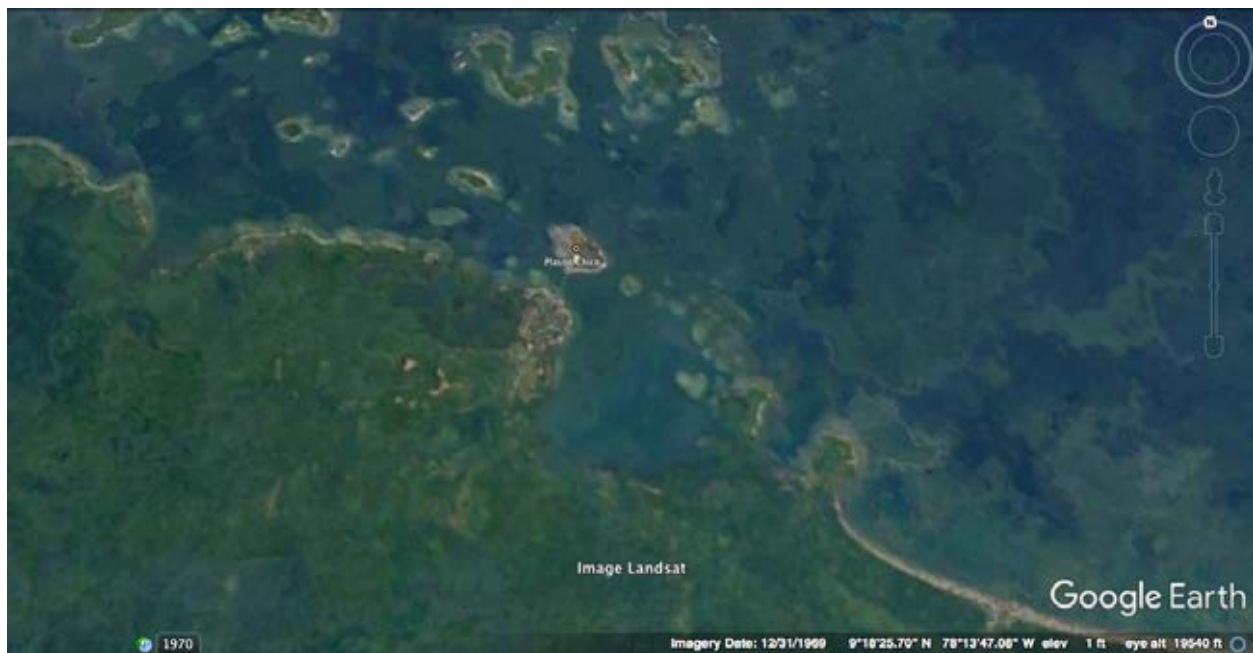
Google Earth's image of Playón Chico (Ukupseni).