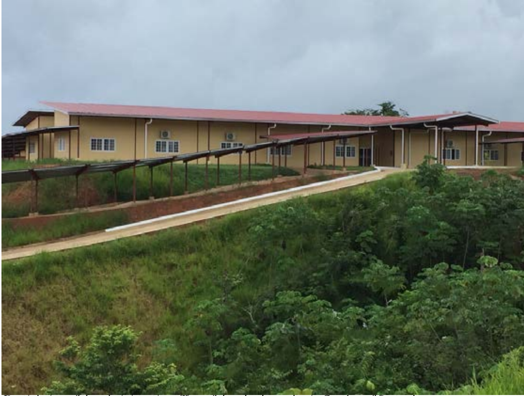
Partial view of the administrative offices of the school complex in Carti as of September 23, 2016.

It is important to keep in mind that at the beginning of 2016 some families at the Gardi Sugdub school were pushing to move to the new building. However, the Ministry of Education was able to persuade them to wait until the construction was finished. Although some classrooms were ready at that time, the site was still considered a construction site with a lot of heavy machinery and materials everywhere which were a real hazard to the children. It is therefore likely that by the beginning of 2017 parents, students and perhaps even school teachers will push very hard to move to the new school, even if the construction has not been entirely finished because the arguments used last year were no longer true 20 .