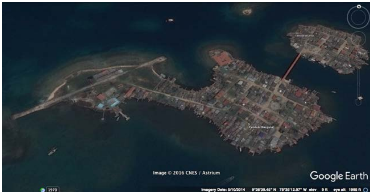
Google Earth's image of Yandub (Narganá) and Corazón de Jesús, and the bridge that connects the two islands.