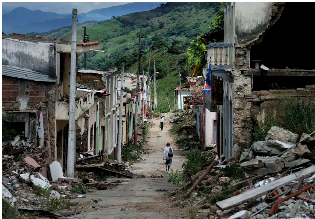
Figure 2: The main street of Gramalote.