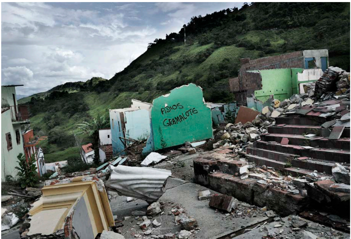
Figure 10: "Goodbye Gramalote".