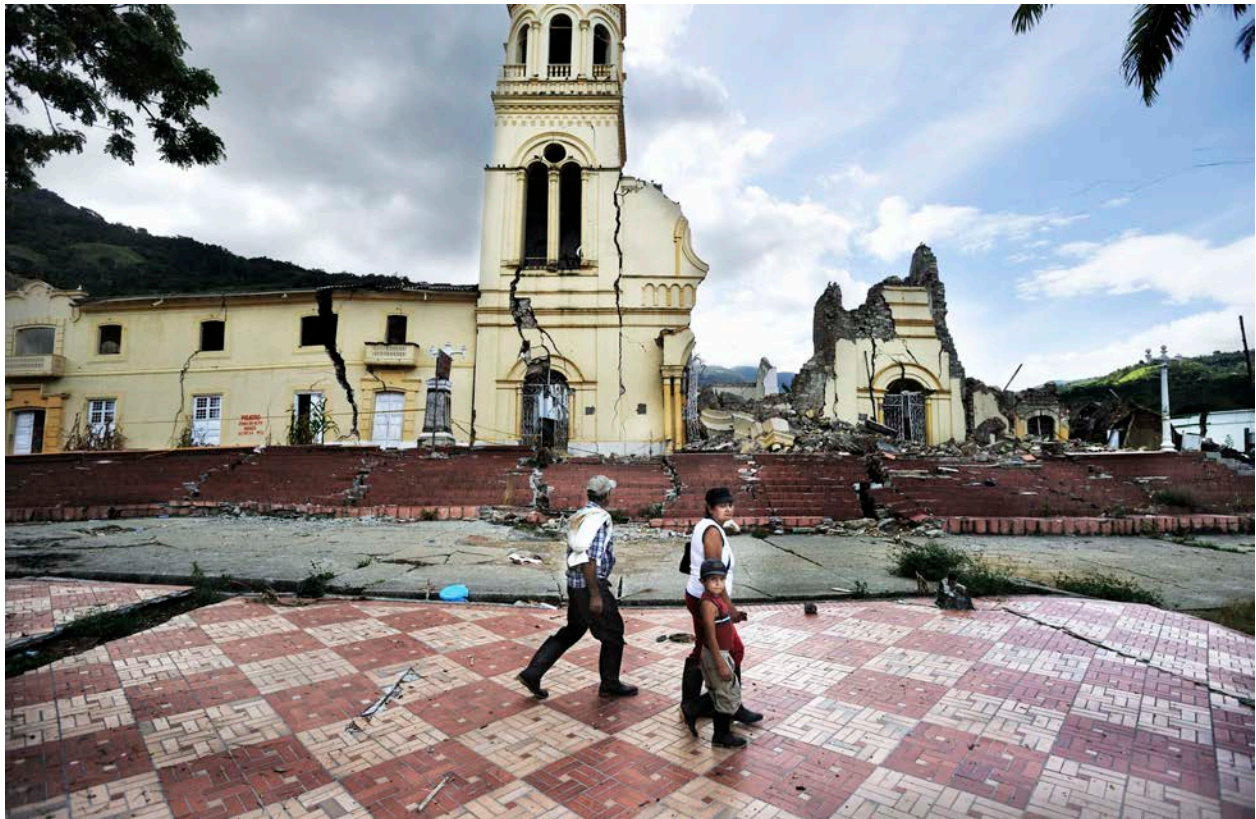
Figure 8: The main church of Gramalote. Only one tower still stands.

It is clear that the Colombian government should use the Peninsula Principles as a source to find a solution to the housing, property and livelihood rights of the people of Gramalote. The legal approach of the Colombian government should be sensitive to the fact that the population of Gramalote has been and remained very attached to its land, territory and culture, and should interpret the Peninsula Principles and other applicable laws and regulations guided by a humanitarian purpose instead of an economic calculation.