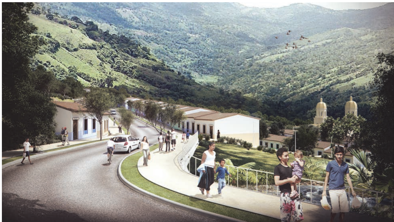
Figure 3: Urban design plan for the new Gramalote. Urban design: Camilo Santamaría.- Arquitectura Urbanismo, Image: Ekoomedia.

Originally, Fondo Adaptación 's budget was around US$4.8 billion dollars. Risk mitigation measures accounted for 28% of the budget and included six megaprojects, of which the most expensive was the Dique Canal (US$525 million, or 10.8%), followed by the investments need in Cali's embankment -"Jarillón de Cali"- (US$429 million, or 8.8%), La Mojana region (US$313 million, 6.4%) and the reconstruction of Gramalote (US$85.5 million, or 1.8%). However, the sectors that received more resources were housing and roads (US$1.1 billion each, or 22.7% each).