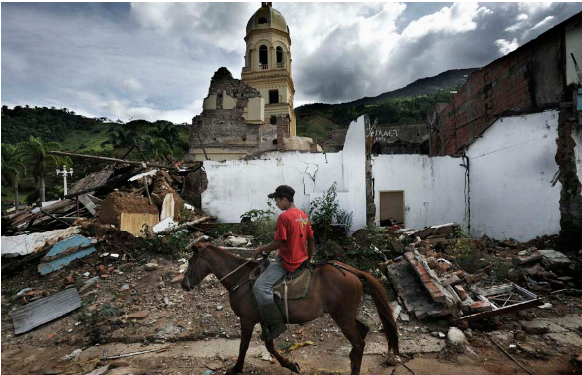
Figure 1: Gramalote after the December 2010 landslides.